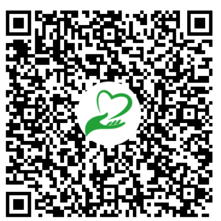
Scan and Donate